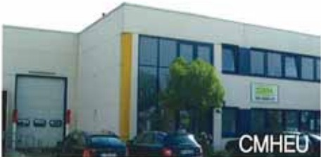
CMHEU Duisburg, Germany