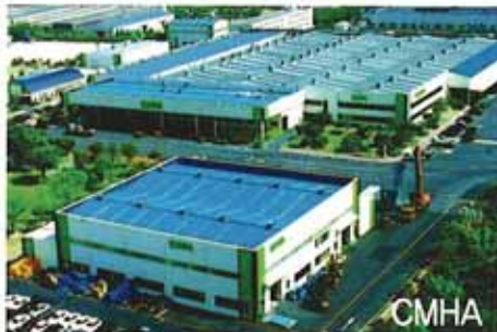
CMHA Changwon, Korea