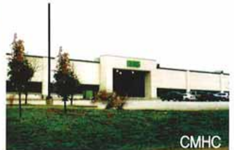
CMHC Lexington, KY, USA