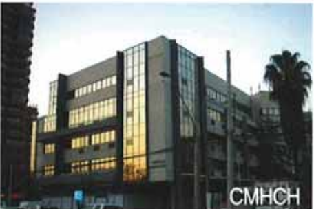
CMHCH Santiago, Chile