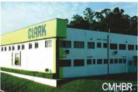
CMHBR Valinhos, Brazil