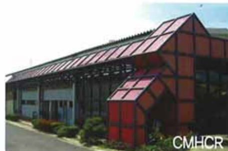
CMHCR San Jose, Costa Rica

Unrivaled Parts Support Our Duisburg, Germany, Louisville, USA, Valinhos, Brazil, and Bucheon, Korea aftermarket distribution centers provide parts to Clark dealers all over the world. We are focusing on providing excellent off-the-shelf availability, quality parts, quick response time and competitive pricing. Our goal is 95% fill rate on parts for Clark Forklifts.