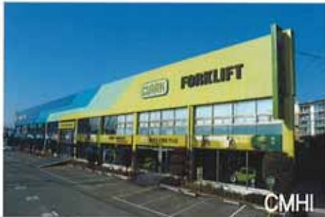
CMHI Bucheon, Korea