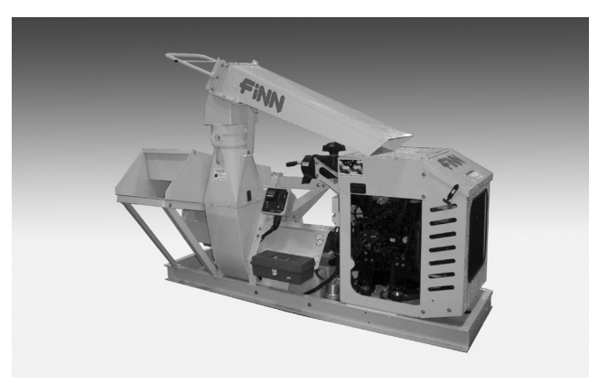
B70, Right Hand Feed, Straw Blower Skid Mounted. (B70S)

As the world leader for over 70 years in the design and manufacture of innovative, quality equipment for the erosion control industry, FINN Corporation is committed to your complete satisfaction.